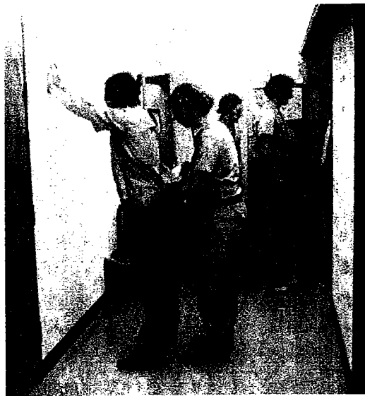
FIGURE 37-2 Stanford Prison “Guard” frisking new “Prisoner.” (Zimbardo’s Stanford prison experiment)

The “Guards” Unlike the prisoners who were required to be in the prison 24/7 (they were incarcerated, after all), the guards worked 8-hour shifts, three men to a shift, and lived their normal lives when not on duty. They were given identical prison guard-style uniforms, nightsticks (although they were not allowed to strike prisoners), and reflective sunglasses designed to give them a menacing and anonymous appearance. Zimbardo explained that his idea for the mirrored sunglasses came from the 1967 film Cool Hand Luke , starring Paul Newman (Zimbardo, 2007). The guards received no